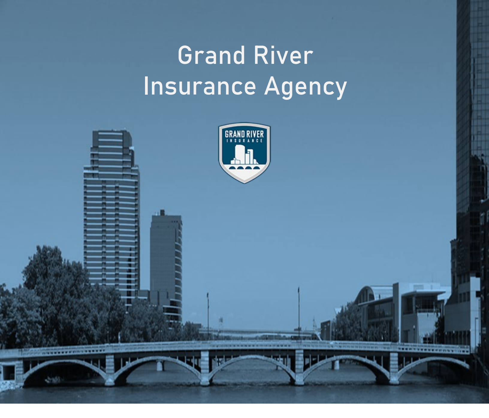
Workers' Compensation Claim Kit - Massachusetts